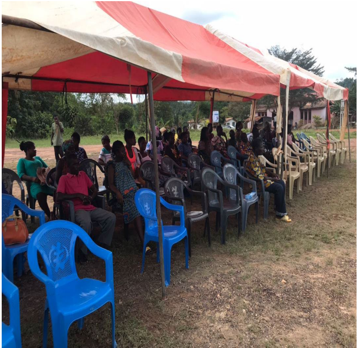
COMMUNITY MEMBERS OF ADUM BANSO AT THE DURBAR GROUNDS