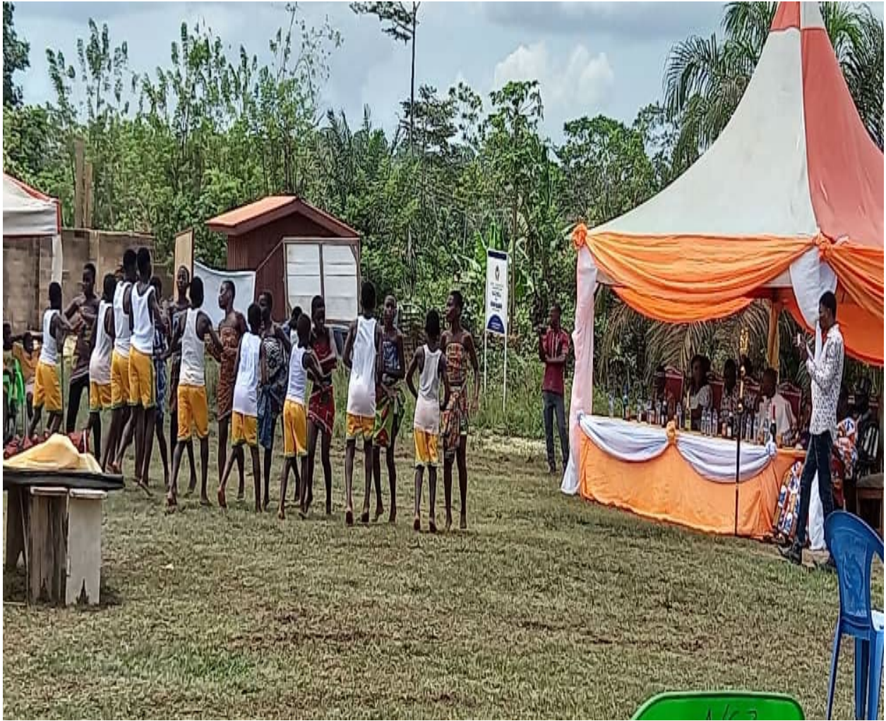
MUSICAL INTERLUDE AND CULTURAL DISPLAY BY STUDENTS OF MY CHILD PREPARATORY SCHOOL-ADUM BANSO