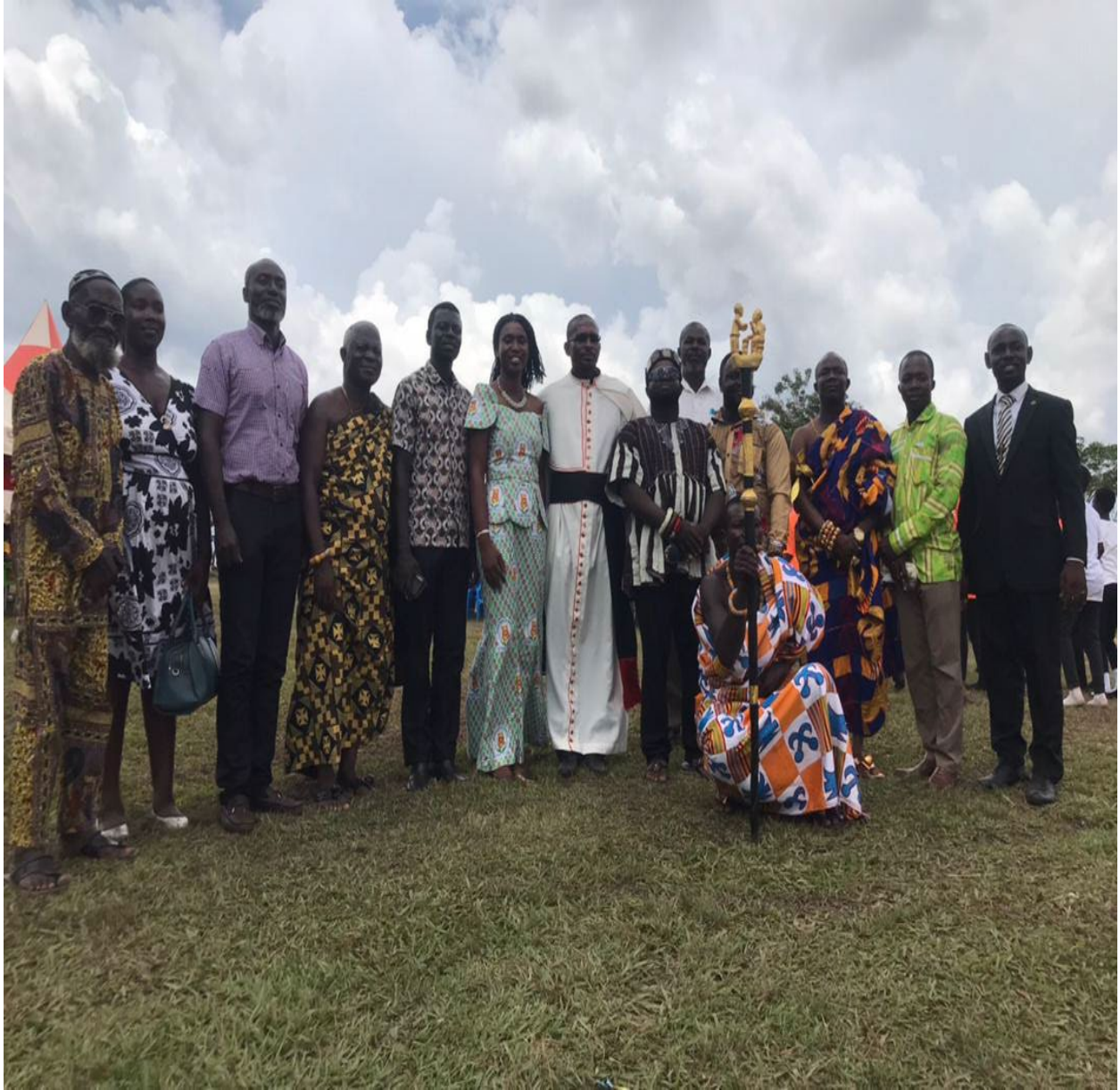
INVITED GUEST PICTURE FOR THE OCCASION