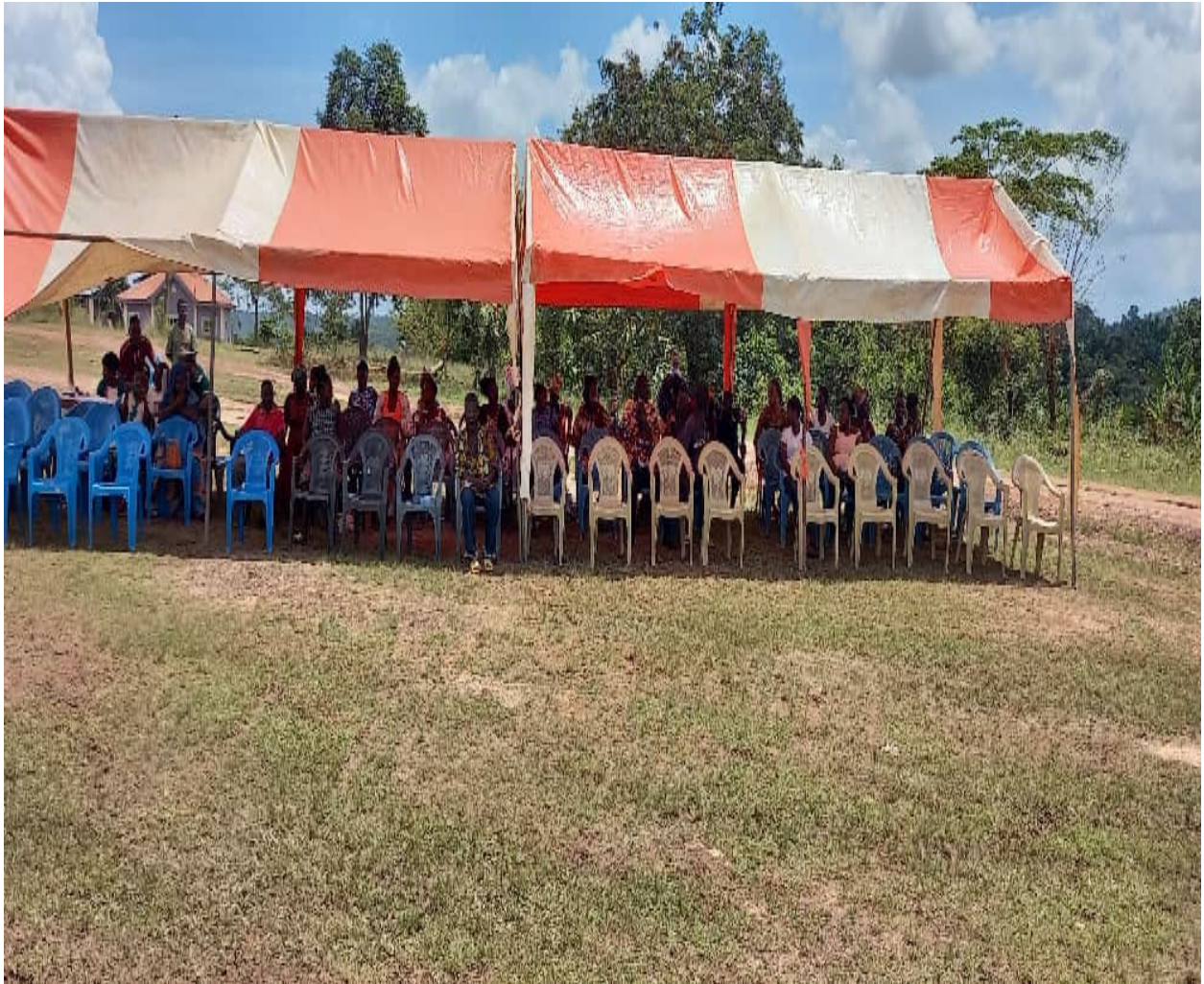
SOME COMMUNITY MEMBERS SEATED AT THE DURABR GROUNDS TO GRACE THE OCCASION