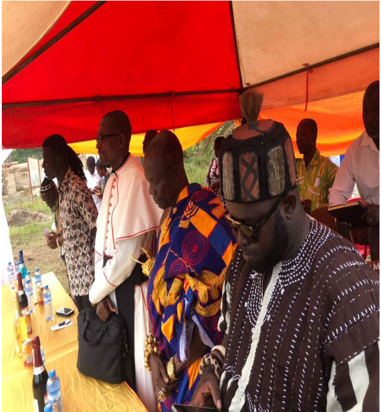
PICTURE OF INVITED DIGNITARIES PRESENT AT THE OCCASION, NANANOM, CHRISTIAN COUNCIL, BOPP COMPANY AND ASSEMBLY MAN AND COMMITTEE CHAIRMAN