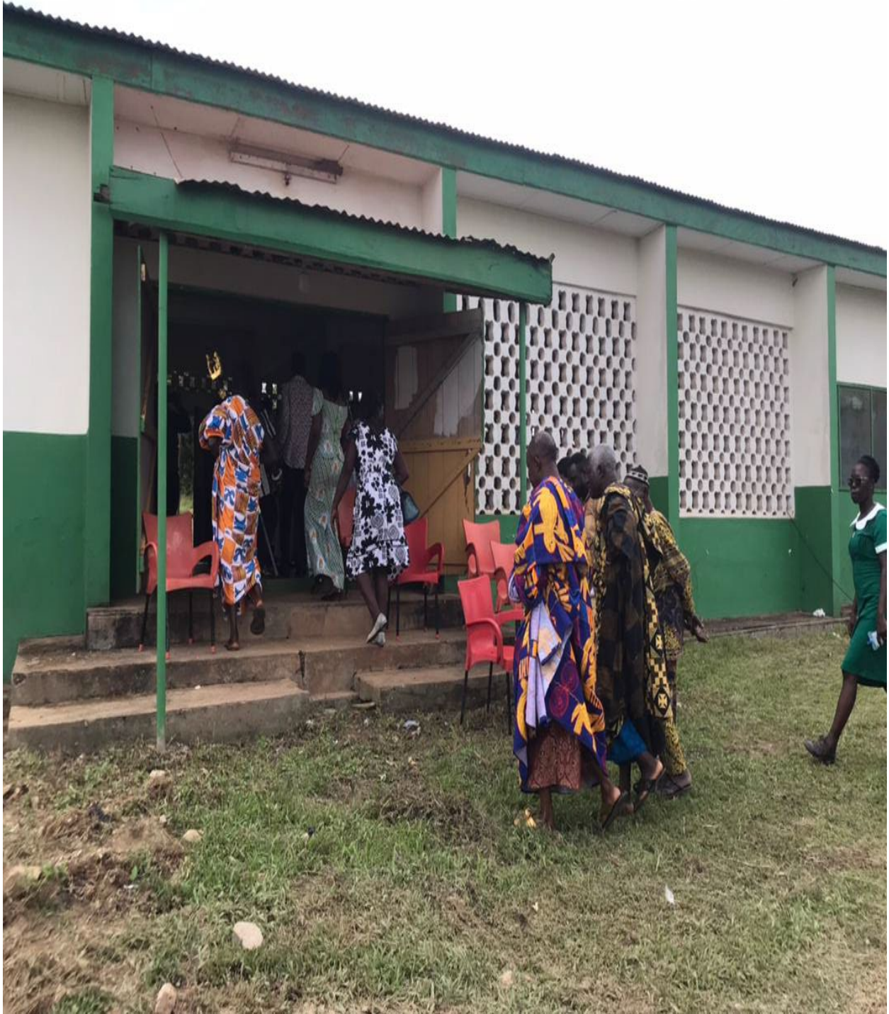
INSPECTION AT THE HEALTH FACILITY BY INVITED GUESTS