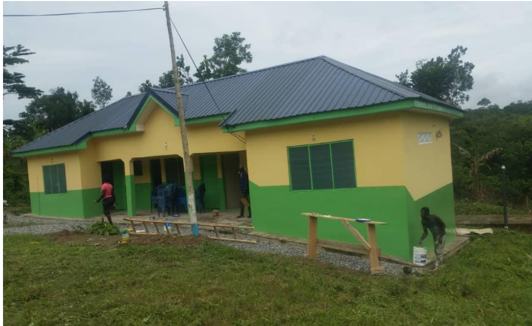
Construction of 60-Bed Facility District Hospital Complex (Agenda 111)