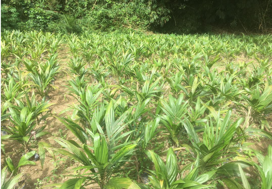
Oil Palm Plantation at Ayiem, Manso and Adum Banso