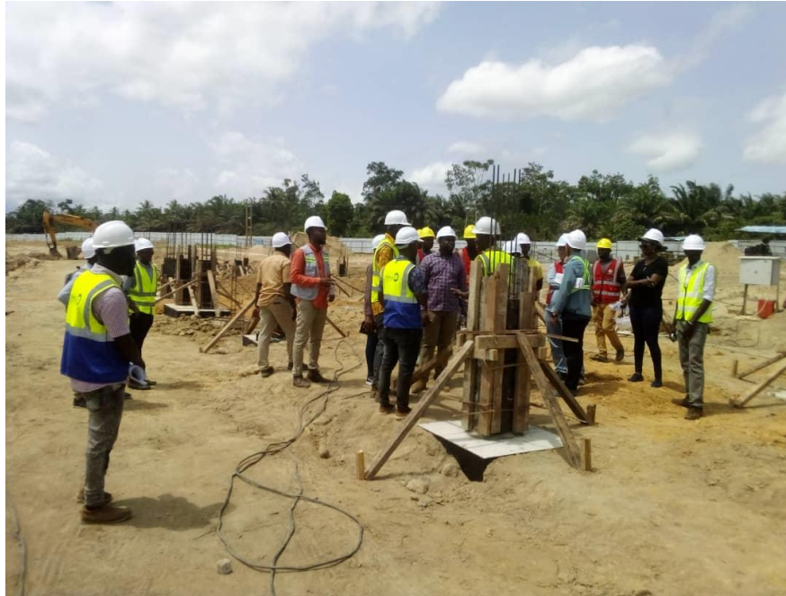
Construction of 60-Bed Facility District Hospital Complex (Agenda 111)