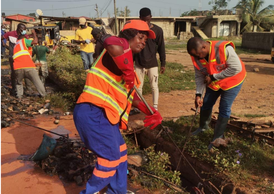
DCE TAKING PART OF COMMUNAL LABOUR AT MPOHOR