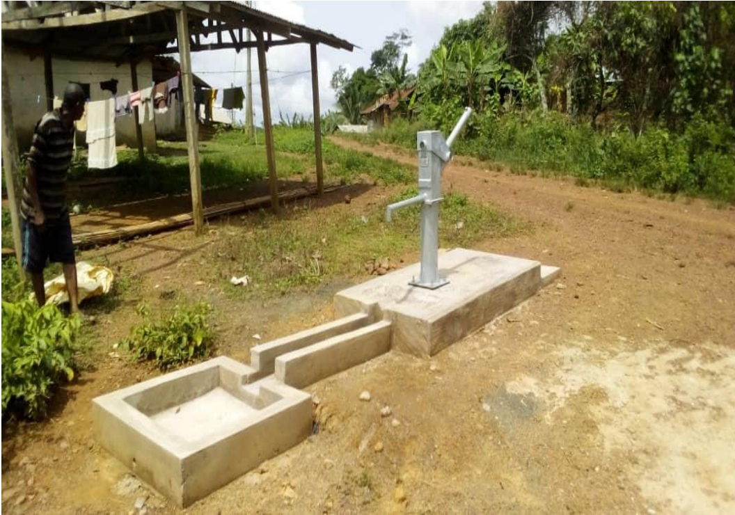
Borehole Water (Hand pump) at Manso