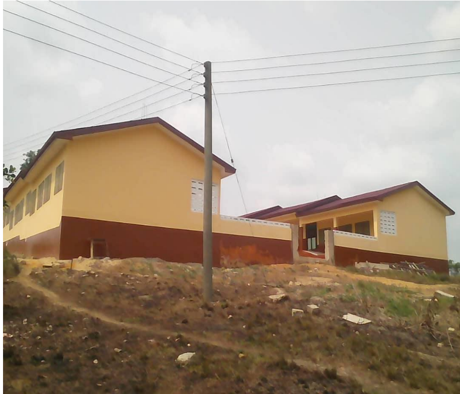
6-Unit Classroom Block at Edaa