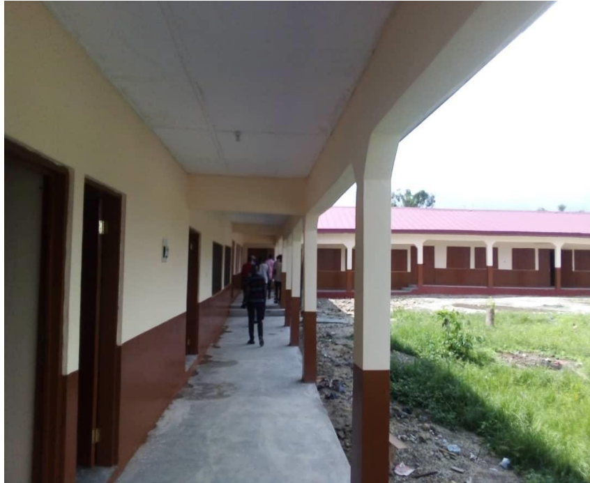
6-Unit Classroom Block at Wiredukrom